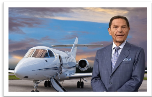
Kenneth Copeland with his latest jet plane

Repentance is the first call in John the Baptist's recorded message (Mark 1v4) as he prepared the way for the Lord Jesus Christ. When the Saviour started his public ministry, His first words in Mark are a command " to repent and believe " (Mark 1v15). However, the Prosperity gospel has no such requirement and so many of its followers have not been called to turn their back on the world and all it stands for.