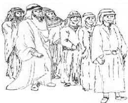
The People of Jerusalem

I will surely deliver thee, and thou shalt not fall by the sword...because thou hast put thy t____ in me, saith the Lord. Jeremiah 39.18