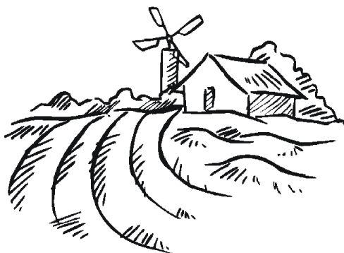
Plant the crop

In the parable, there was a farmer. Each year, the farmer had to sow his crops, and after they had grown harvest them. Join with lines what the farmer had to do each year in order and colour the pictures.