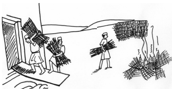
Harvest the crops