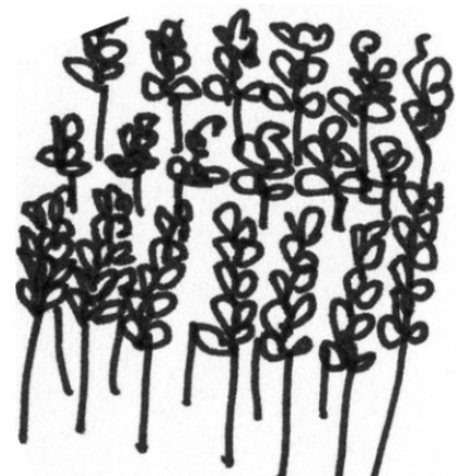
Let the crops grow