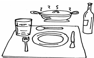
eating & drinking